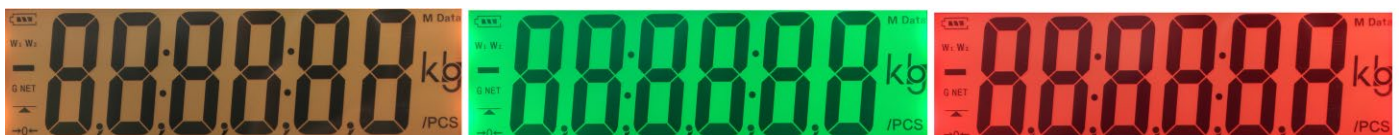
Adjustable Tri-Color Check Result Backlight